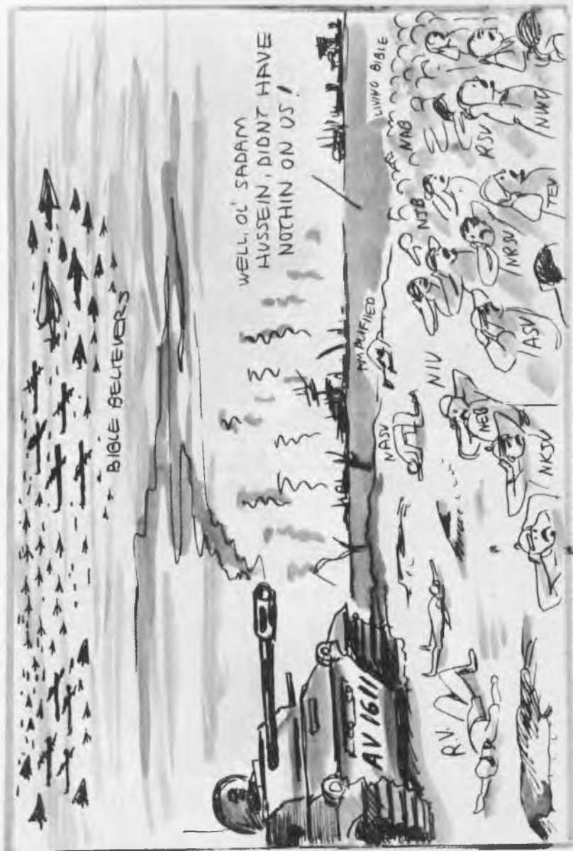
THE TRANSLATING "GULF CRISIS" -----1991